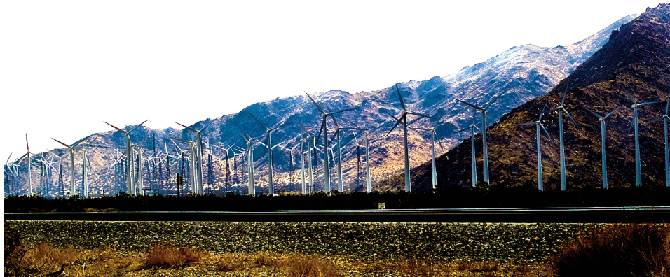
Fig. 1. San Geronio Pass Windfarm in Riverside County, California. With more than 2,000 wind turbines installed, this windfarm produces enough electricity to power Palm Springs and the entire Coachella Valley. 28 Photograph by Annie Chen

It is popular belief that the audio frequency range of human hearing is from 20 to 20,000 Hz and that anything beyond these limits is undetectable by humans. Infrasound is the term that describes the “inaudible” frequencies below 20 Hz. Such a belief is based on the steep slope of hearing thresholds toward the lower end of the human hearing range. 4,5 At 1 kHz, the sound pressure level (SPL) necessary to perceive a 10 phon sound is 10 dB SPL. At 20 Hz, the minimum SPL for 10 phon sound perception has increased to about 84 dB SPL. The phon is a unit that describes perceived loudness level. With decreasing frequencies, the SPLs necessary for sound perception increase rapidly, making very low frequencies at a normally audible intensity more difficult to detect than higher frequencies of the same intensity. Humans’ lack of sensitivity to low frequencies is also reflected in the compression of hearing thresholds. At 1 kHz, the SPLs capable of triggering hearing range from 4 to more than 100 dB SPL, exceeding 100 dB in span and increasing at 10 dB/phon. In contrast, the SPL range at 20 Hz is from approximately 80 to 130 dB SPL, spanning only about 50 dB and increasing at 5 dB/phon. 4 In other words, a relatively small increase in SPL at 20 Hz would